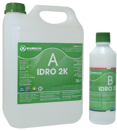
1 Gal. A+B

COMPLETELY DRY: interval before the floor is ready for complete use: e.g. for furniture removal, to allow other craftsmen to carry out work, to start maintenance of the floor, etc.