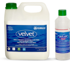
1 Gal - 0,1 Gal IMPROVER

Single component polyurethane waterborne clear finishing treatment with S-XL technology, formulated with renewable raw materials. Floors treated with VELVET have a completely natural appearance and a unique, velvety feel to the touch. Thanks to the high solid content and the extraordinary drying speed, the product allows very fast work cycles to be carried out (1-2 hours according to environmental conditions). Another very important feature is the ease with which the floors can be touched up if the surface is damaged or in the event of localized defects: in fact, work can be carried out just on those areas by marking them off with tape, sanding them and then reapplying the product. When the surface is dry, there are no signs of marks or imperfections. For rooms subject to heavy traffic, we recommend adding 10% VELVET IMPROVER to the last coat.